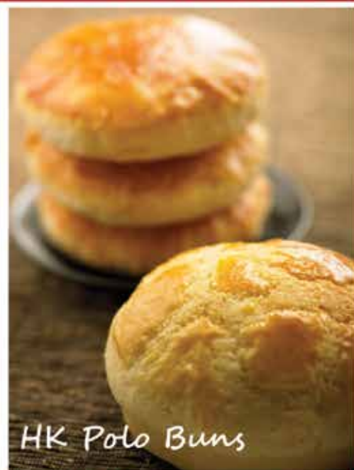
HK Polo Buns

8Tarts n Pastries (百达美点) was established in 2002 with the aim of bringing authentic and traditional Hand-Made Hong Kong style pastries to Singapore with a touch of Asian flavours. We offer a wide range of tarts, pastries, cookies, buns and other savouries to choose from. During every Chinese New Year, we will launch our sweet and savoury Nian Gao (Traditional, Water Chestnut, Red Bean, Carrot, Yam) so remember to check it out!