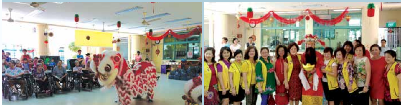
LCS ORCHID (17 FEBRUARY 2013)