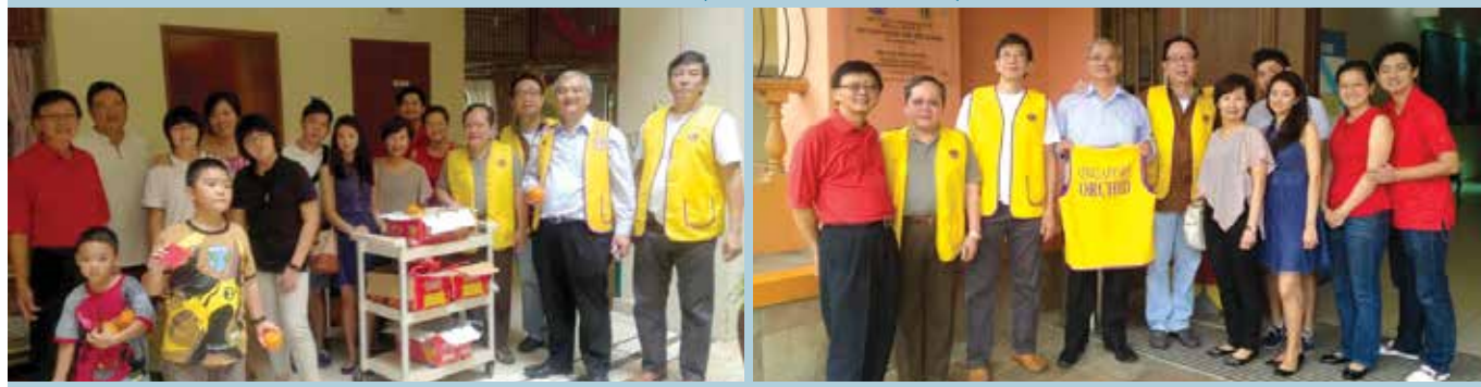
LCS ORCHID (17 FEBRUARY 2013)