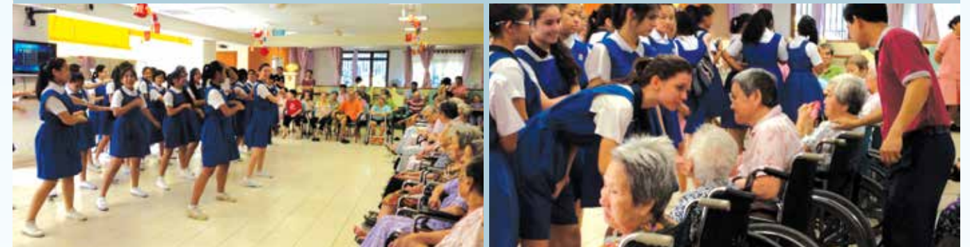
LCS CITY, CENTRAL AND ORIENTAL (16 FEBRUARY 2013)