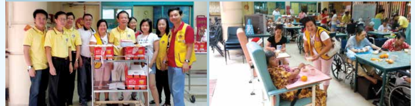
LCS SOUTH AND CHIJ KATONG CONVENT SECONDARY (24 FEBRUARY 2013)