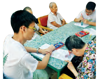
Students from Temasek Junior College guiding Bedok Home residents in their colouring activities on 2 July 2016