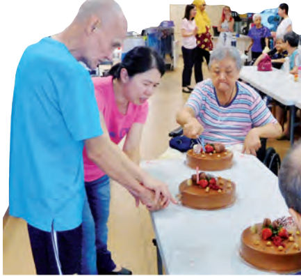
Staff of Food from the Heart and Ministry of Education bringing sparkles of joy to Bishan Home residents with birthday celebrations and games on 20 July 2016