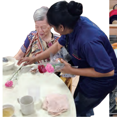
Staff from Marina Bay Sands surprised residents with pink and red roses on 6 May 2016 to celebrate Mother's Day