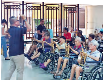
Staff from The Esplanade Co Ltd visited the Home on 3 May 2016 and taught the residents how to play the Angklung, a popular bamboo musical instrument