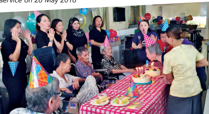
Thoughtful staff from Charles & Keith enlivened the Home on 15 June 2016 with colourful decorations to celebrate some of the residents' birthdays