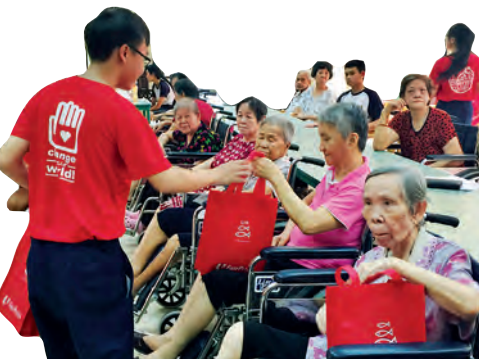
Residents were in high spirits as they received goodie bags from Temasek Secondary School students on 30 May 2016