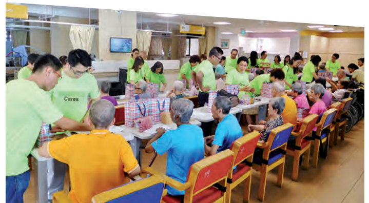
Staff from Pon Asia Pte Holding Pte Ltd and RSVP came together on 10 June 2016 and distributed customised gift bags to the delighted residents