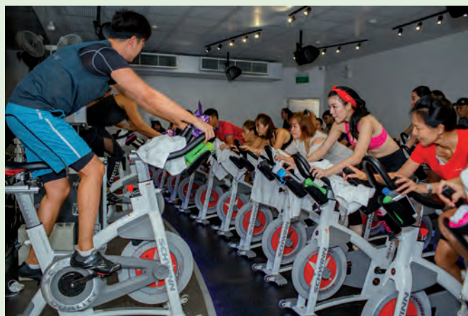
All riders had geared themselves up fully to complete the riding challenge

I decided to put my networking skills to test and organise a simple yet effective fundraising event – "Ride Back" – that was targeted to raise $5,000 within a month and at the same time raise public awareness of the Lions Home. With the immense support of family and friends, the event exceeded my expectations with more than $7,000 raised! This definitely motivated me to raise funds independently again either through my own resources or to play a role in a bigger fundraising team.