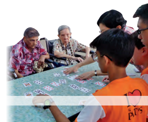
Students from St. Patrick's School enhancing the spirit of residents with memory card games on 5 July 2016