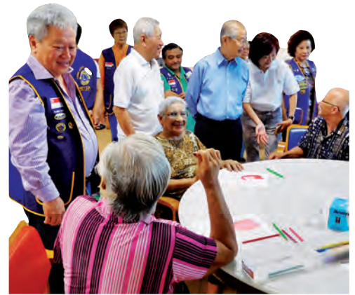
Members of LCS Meyer and CARE Centre bringing cheer to the residents on 23 July 2016