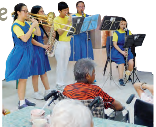
The band from Anderson Secondary School showcasing their musical talent to residents on 19 May 2016