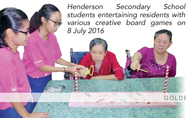
Henderson Secondary School students entertaining residents with various creative board games on 8 July 2016