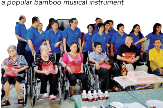
Staff from Bukit Sembawang Estates Limited brought a birthday cake and lots of gifts to share with the residents on 30 June 2016