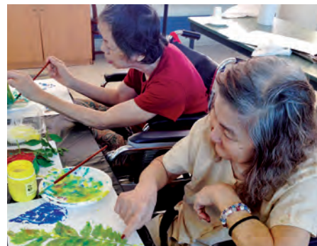
Another resident admiring her completed painting