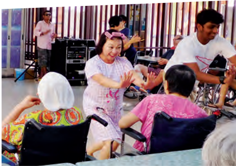
Residents were fascinated with the amusing performances by The Necessary Stage on 14 April 2016