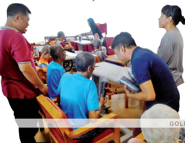
Benchmark Electronics staff treated residents to a mouth-watering buffet on 13 May 2016 and presented them with souvenirs