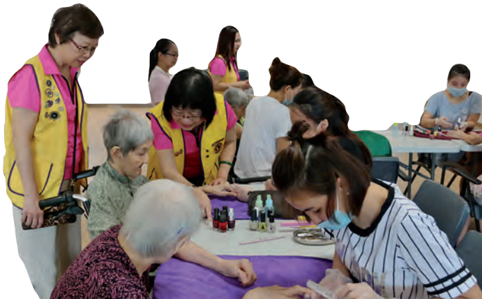
LCS Evergreen visited the Home with a group of skilful manicurists who pampered the residents with their excellent service on 26 May 2016