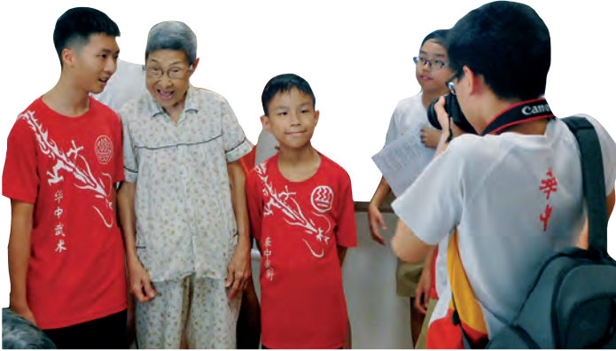
A joyous resident posing for a photo with the Wu Shu student performers from Hwa Chong Institution after their fabulous performance on 15 March 2016