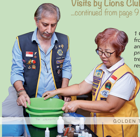
1 October 2016: Lions from LCS Arcadia and LCS Tanah Merah preparing facial treatments for Home residents