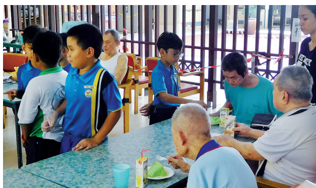
30 September 2016: Students from Telok Kurau Primary School (Soccer) treating the residents to a light tea-break