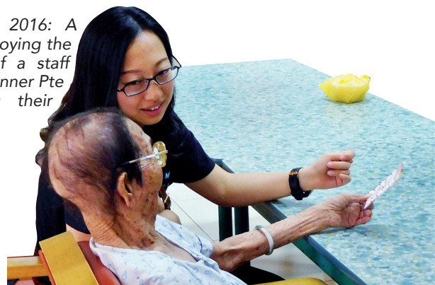
7 October 2016: A resident enjoying the company of a staff from Skyscanner Pte Ltd during their visit