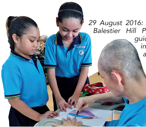
29 August 2016: Students from Balestier Hill Primary School guiding a resident in the colouring activity