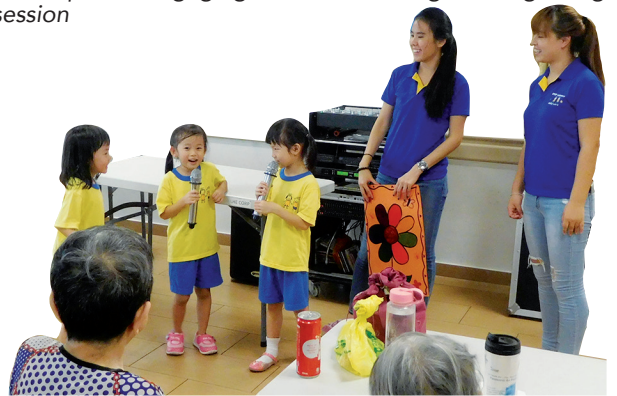
18 October 2016: Teachers from Star Learners @ Jurong West surprised residents with a huge handmade card as the kids expressed their thanks to the residents