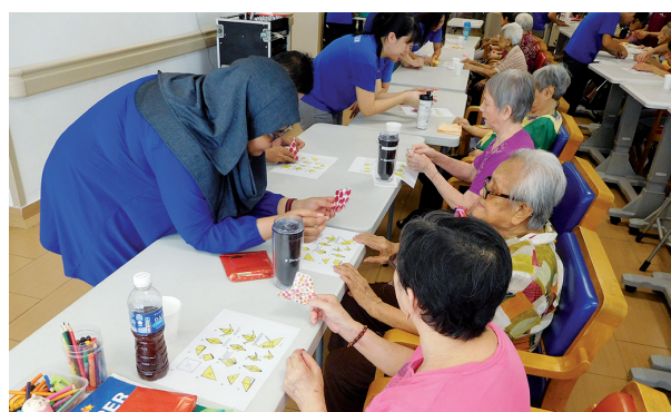
28 September 2016: Residents were fascinated by a volunteer's skillful hands during a visit by The Nielsen Company (Singapore)