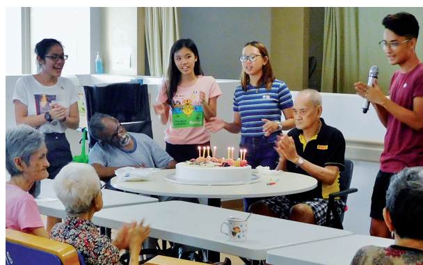
19 October 2016: Volunteers from Food From The Heart and Temasek Polytechnic (Music Vox) visited the Home to celebrate residents' birthdays