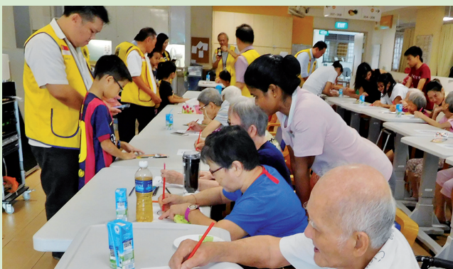
7 September 2016: Lions from LCS Whampoa interacting with residents during the colouring session