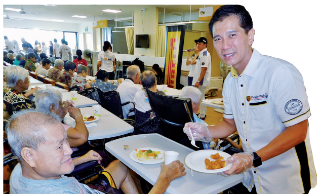
20 August 2016: A staff from Porsche Club serving delicious food to a resident during its visit