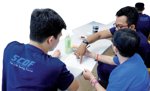
22 August 2016: Firefighters from Bishan Fire Station helping a resident with a bingo sheet