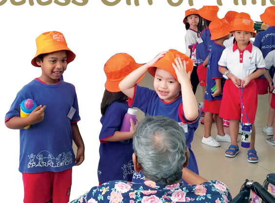
28 July 2016: Cheerful kids from PCF Sparkletots Preschool greeting residents before the start of their singing performance