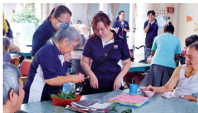
13 September 2016: Temasek Primary School Staff demonstrating the making of towel roses to the residents