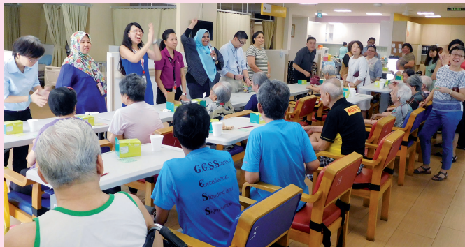
Staff from Kuo Chuan Presbyterian Primary School getting all excited during the bingo session with our residents on 3 October 2016

The KCPP Values in Action (VIA) Programme for staff aims to promote active citizenry among KCPPians to make a difference to the lives of others in the community. The Lions Home for the Elders, a stone's throw from the school on Bishan Street 13, is one of the organisations that the school works with. This year, groups of school staff comprising teachers and administrative officers visited the Home on three occasions bringing with them “Amazing Love”, which is one of the school's values, to the residents.