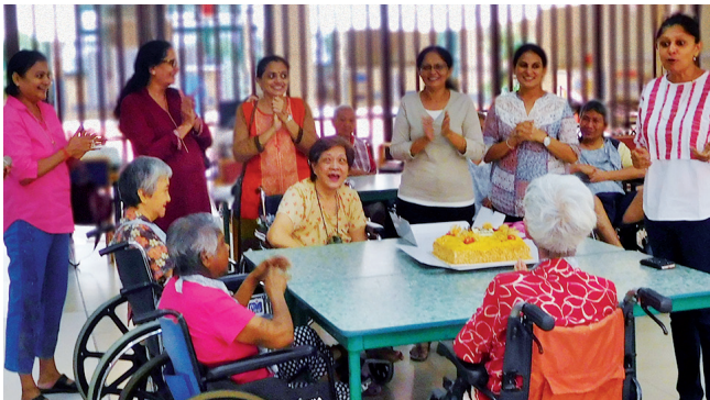
20 September 2016: Love and Care (Shrimad Rajchandra Mission) visited the Home to celebrate residents' birthdays