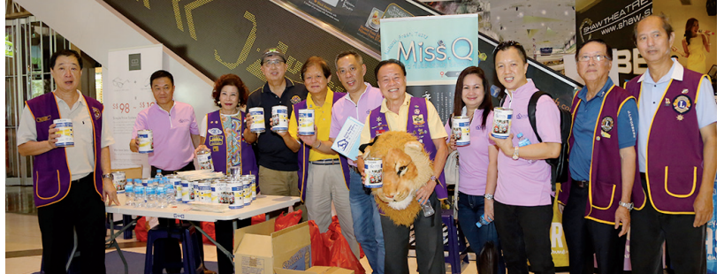
Lions Home Management Board travelled island-wide to support each collection station