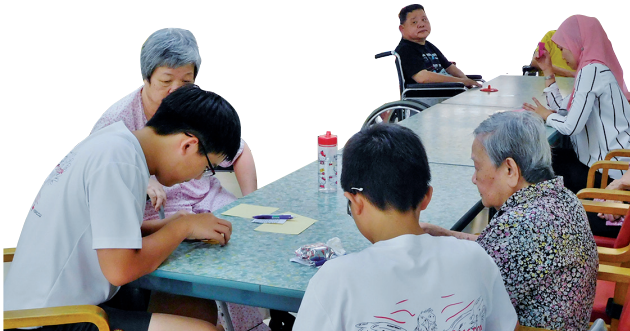
10 October 2016: Students from Victoria School (Red Cross) guiding residents in the handicraft session during their visit