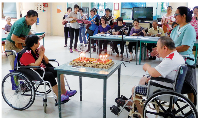
26 July 2016: Joyful music filled the air with members from Bedok Orchid RC (Bedok South) Ukulele Interest Group celebrating residents' birthdays