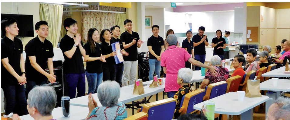
4 November 2016: Staff from Finexis Advisory Pte Ltd organised sing-along sessions and games for the residents