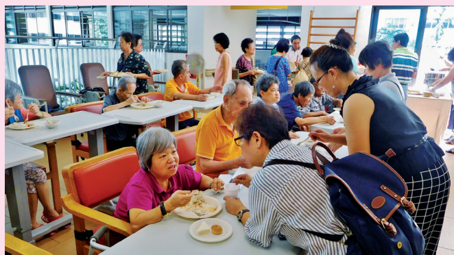
Home residents were treated to a delightful tea-break from members of Zion Bishan Bible Presbyterian Church on 22 March 2016

Convictions are no mere perceived theory but perspired reality. It is both heart work and hard work. That is why we were so grateful to the Lions Home in Bishan for opening its doors to allow us to put our faith into practice. On 22 March 2016 about 40 of us from Zion Bishan Bible Presbyterian Church celebrated Easter with about 20 residents from Lions Home.