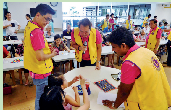
15 October 2016: Lions from LCS Nassim having a great time with the residents playing bingo (above & right)