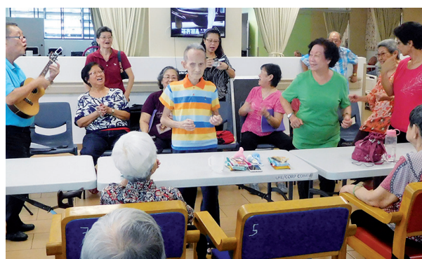
5 October 2016: Two enthusiastic residents joining the team of volunteers from Econ Health & Wellness Centre (Bishan) in the dance segment