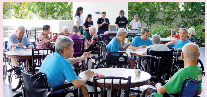
Students from Raffles Institution Piano Ensemble liven up the atmosphere with oldies while residents enjoy their tea-break on 6 June 2016