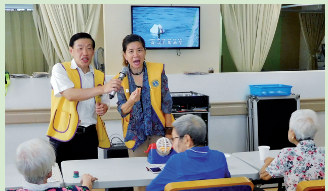
24 September 2016: LCS Sentosa brought joy to the residents through exciting bingo games and a karaoke session