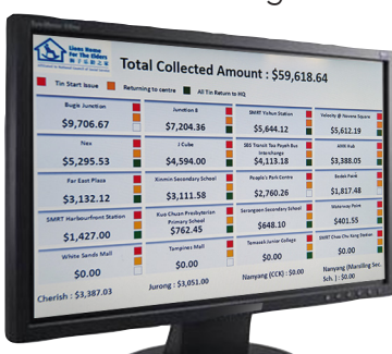
Real-time projection of amount collected at each station