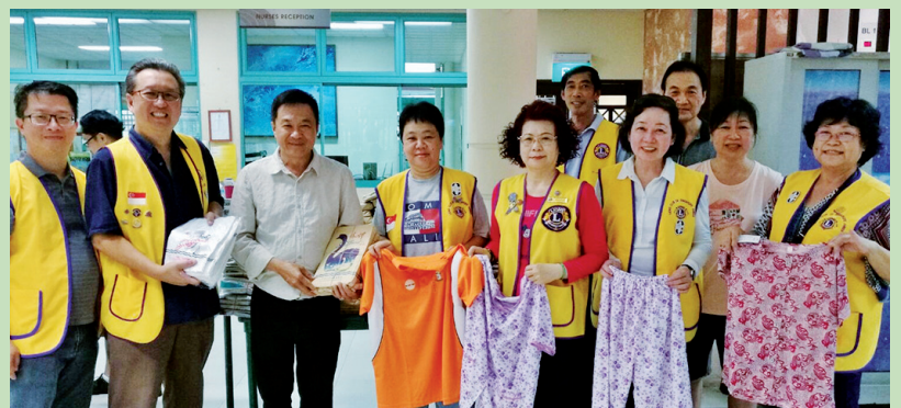
23 October 2016: LCS Amber visited Bedok Home to serve hot meals and to donate pyjamas to the residents