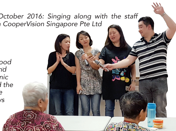
28 October 2016: Singing along with the staff from CooperVision Singapore Pte Ltd