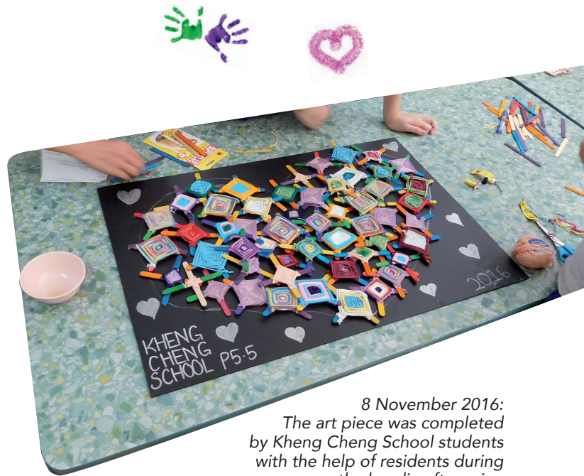
8 November 2016: The art piece was completed by Kheng Cheng School students with the help of residents during the handicraft session