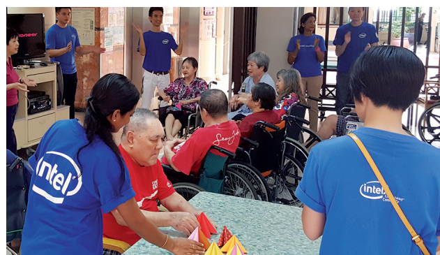
15 September 2016: Residents singing their hearts out with staff from Intel Mobile Communication SEA Pte Ltd during their visit