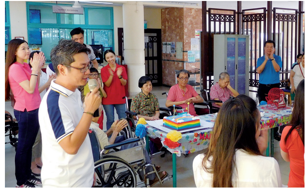
19 August 2016: Through birthday celebrations and fun-filled games, staff from Hong Leong Asia Ltd brought sparkles of joy to the Home