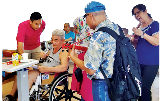
2 September 2016: Volunteers from Ministry of National Development engaging a resident during the sing-along session