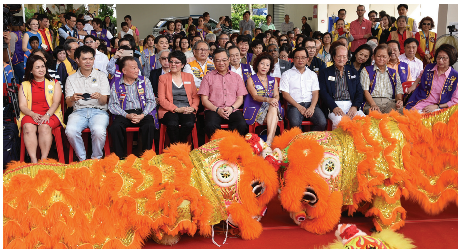
An auspicious lion dance performance at the Official Opening of the Lions Home (Bishan).