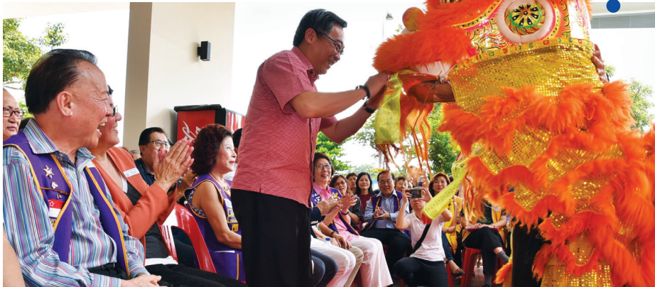
Guest-of-Honour, Mr Gan Kim Yong, receiving a scroll symbolising blessings, from the mouth of the 'Lion' amidst the spontaneous applause from the audience.

The Bishan Home of the Lions Home for the Elders at Bishan Street 13 was officially opened by Minister for Health Gan Kim Yong on 18 March 2017.