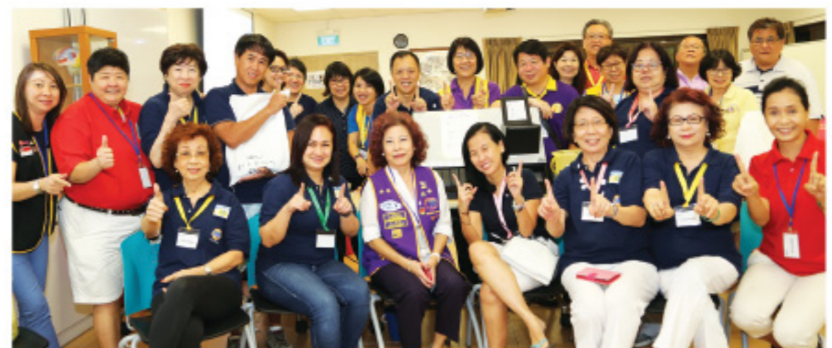
Thumbs up and forefingers up signifying 11-11! A very alert team of money counters despite the late hour.