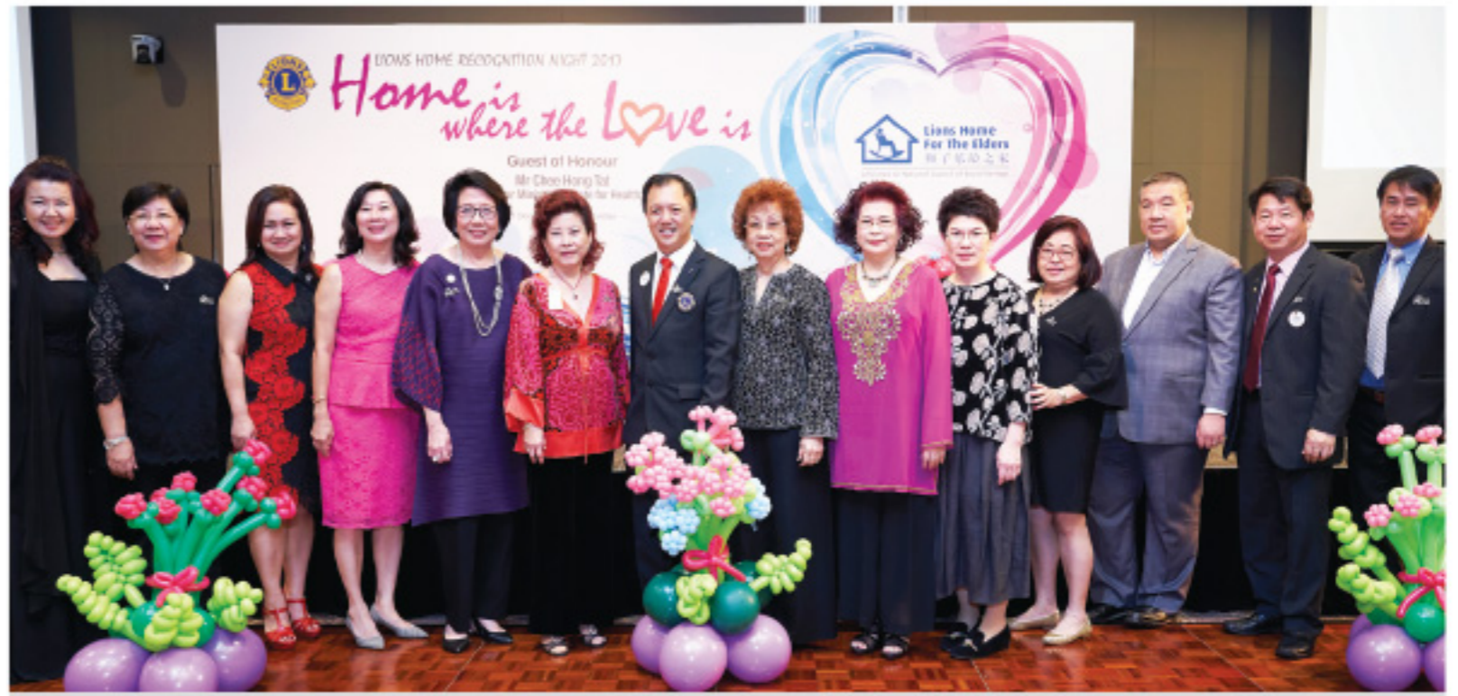
A big thank you to the Organising Committee for a wonderful time and a fabulous evening.