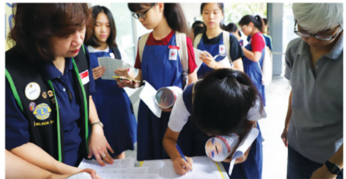
Student volunteers all geared up to collect tins to raise funds for Lions Home.

Kheng Cheng School • Land Transport Authority Singapore • Nanyang Academy of Fine Arts • Panasonic Industrial Devices Singapore • Riello UPS Singapore Pte Ltd