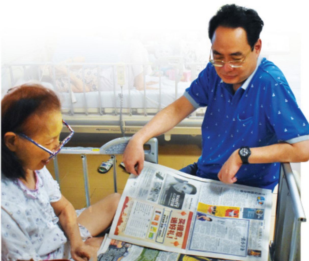
A family member reading newspapers to a resident.