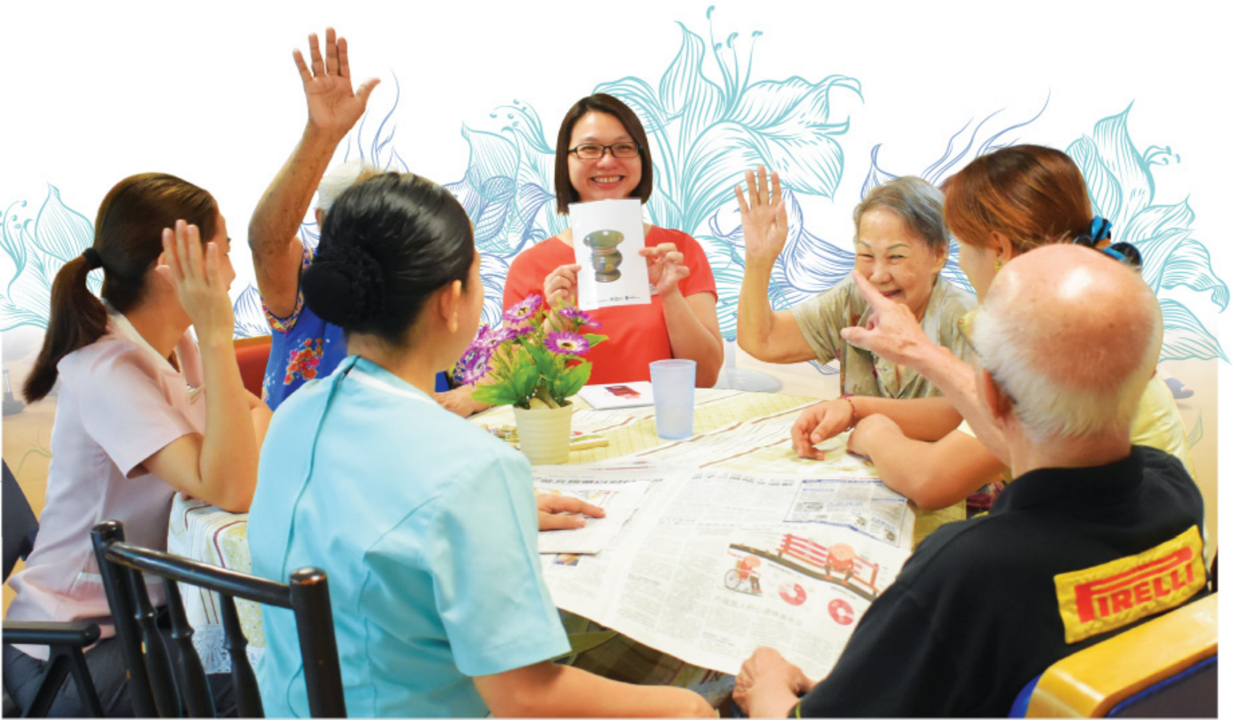
Residents engaging in stimulating and purposeful activities.