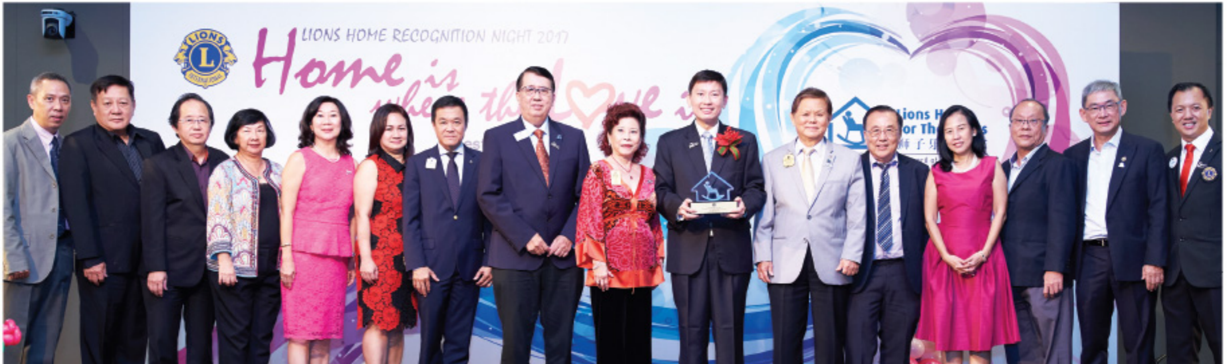
Lions Home Management Board members taking a group photo with Guest of Honour, Senior Minister of State for Health, Mr Chee Hong Tat.