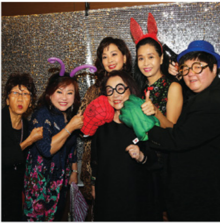
Lions having loads of fun at the Photobooth.