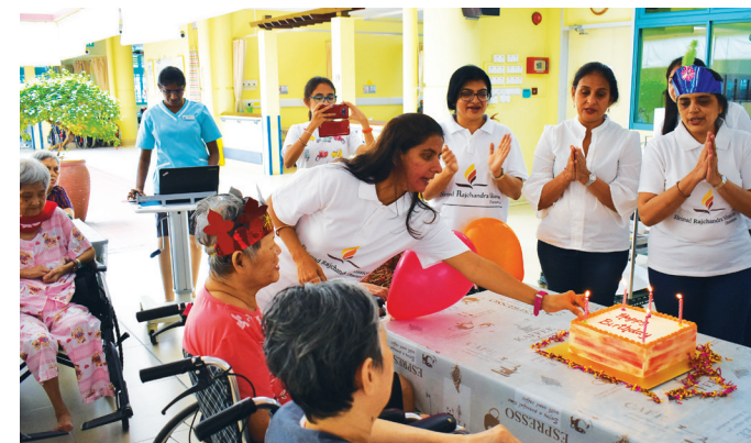
Celebrating residents' birthdays – each month is special!

SRLC is grateful to Lions Home for providing us with the opportunity to serve and it endeavours in every possible way to continually make a difference in the lives of the residents.