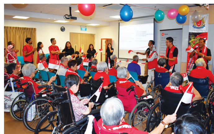
Singing and waving the National Day Flags proudly as one.

and swaying their bodies as they learnt the new technology of Exergame, a software developed by NTU to encourage seniors to exercise in a fun way. Local snacks such as teh tarik, ice-cream, tau huay, piring wafer biscuits and kacang puteh were hot favourites among the residents.