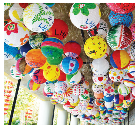
Our residents' wonderful artwork.