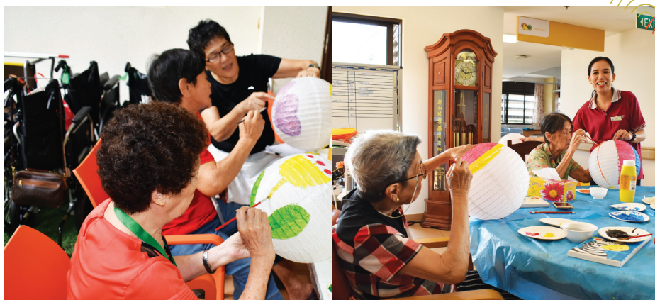
Caught in action – All so focused on painting!

It is in giving that we receive, and I am very proud of our residents in the Lions Homes. Their efforts not only gave them joy, but also made the festival more vibrant and enjoyable for the public who celebrated at the Gardens by the Bay.