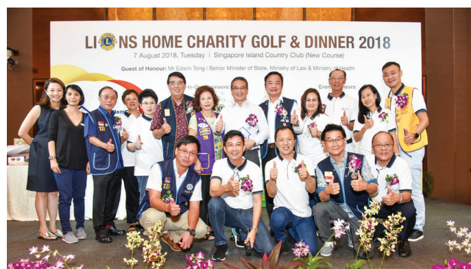
Lions Home Charity Golf & Dinner 2018 Organising Committee with Guest-of-Honour Senior Minister of State for Health Mr Edwin Tong.