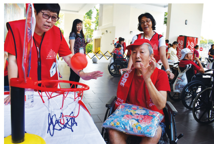
Showing off his basketball skill – All in, no miss!