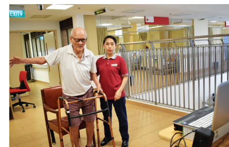
A staff member oversees the process as resident engages in Jintronix.