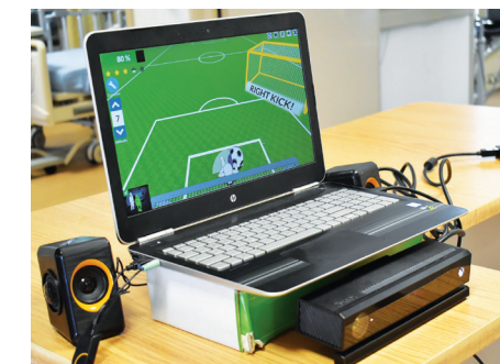
Jintronix – Soccer game.

The home is constantly exploring opportunities, to incorporate new technologies to enhance quality of care, and provide residents with optimal rehabilitation experience.