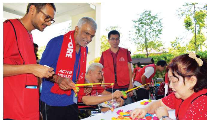
One of the most popular games – Dry Fishing!

At the photo booth, residents smiled happily to have their pictures taken. They were also caught waving their hands