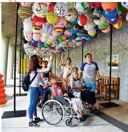
Our residents looking out for the lanterns they painted.