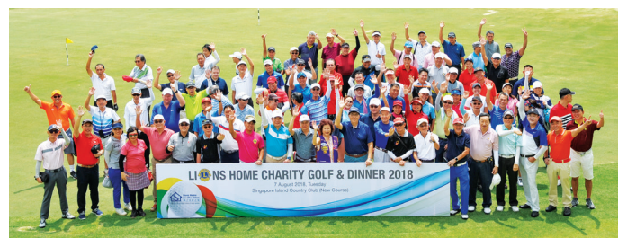
Group Shot before Tee-off.

For more photos, visit Donors & Volunteers Acknowledgement Gallery on the Lions Home website www.lionshome.org.sg .